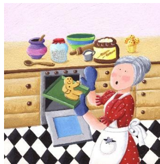
Jumping #figure 3.1

Example: The gingerbread man jumped out of the tin and ran out of the open window shouting, “Don’t eat me!”