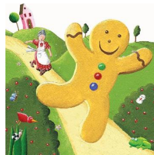
Faraway #figure 3.2

#figure 3.1