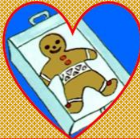
The Bread man

Once upon a time a little old woman and a little old man lived in a cottage. One day the little old woman made a gingerbread man. She gave him currants for eyes and cherries for buttons. She put him in the oven to bake.